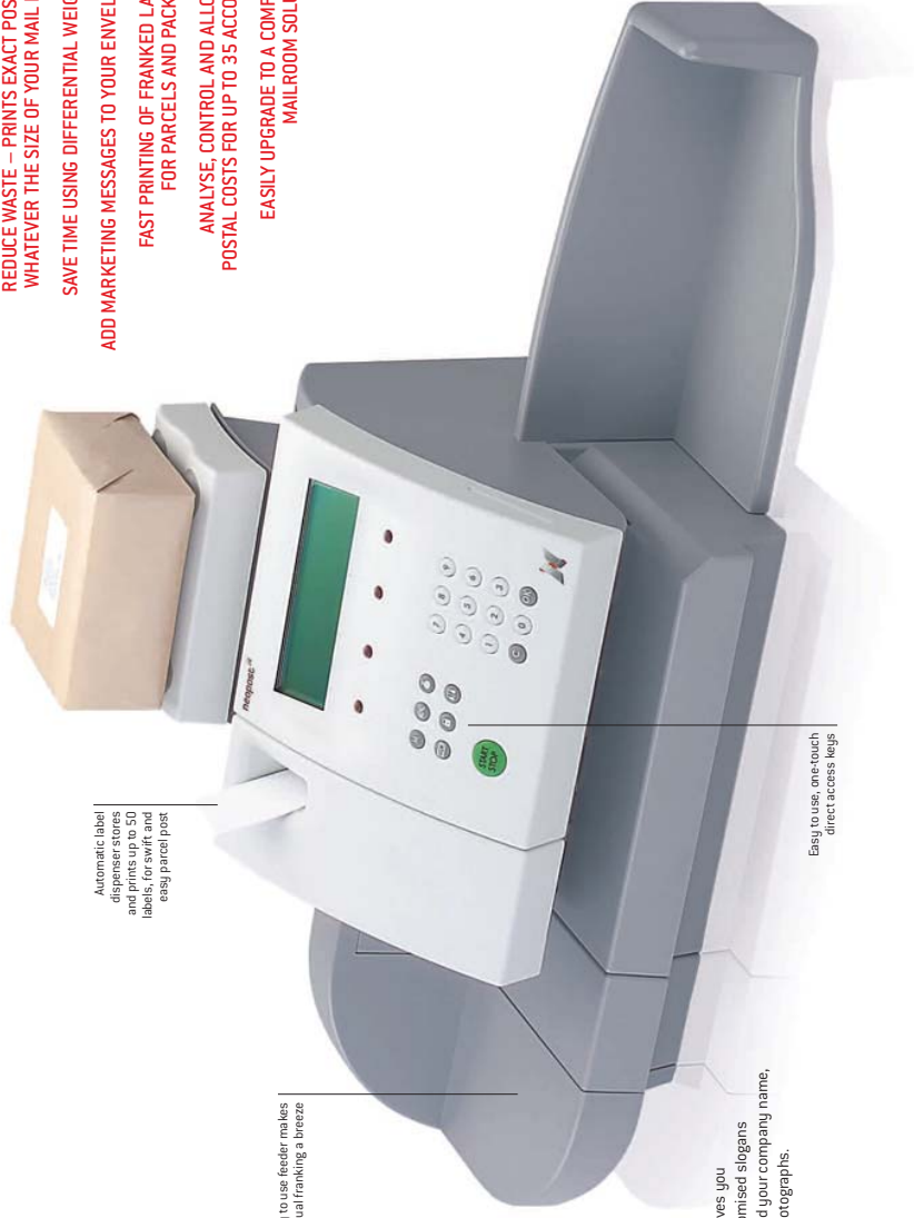
Automatic label dispenser stores and dispenses labels for swift and easy parcel post.